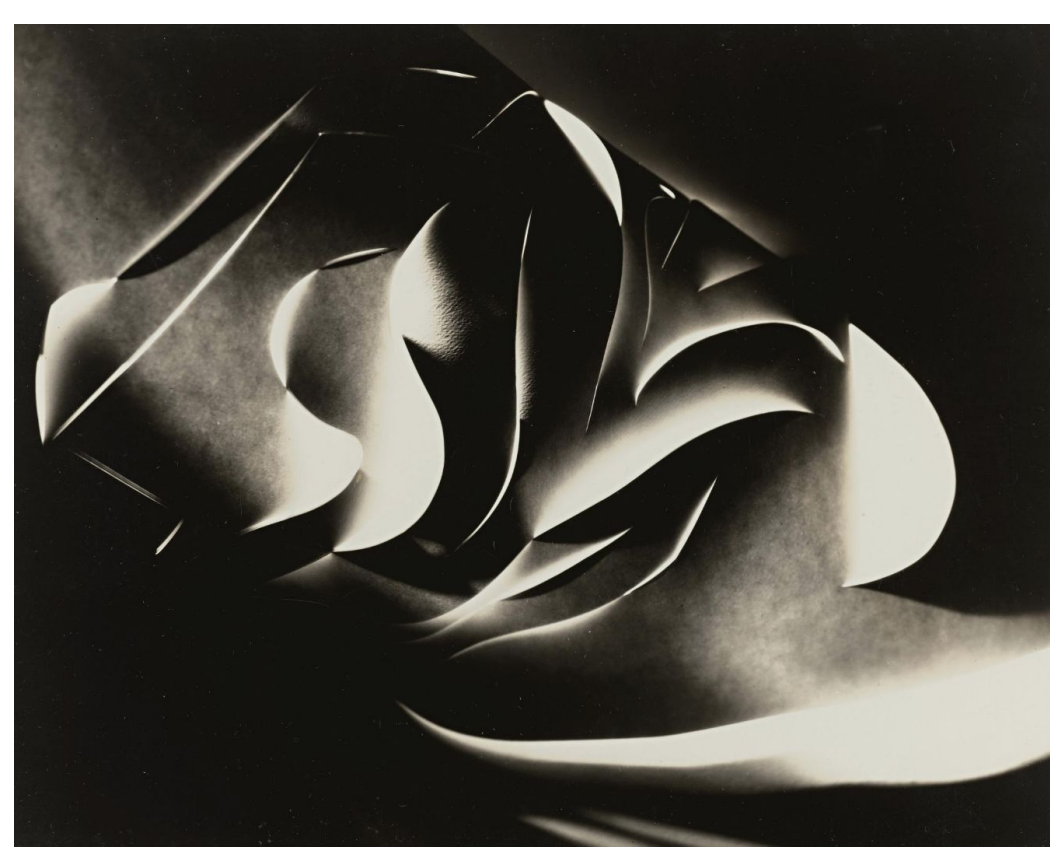
Francis Bruguière - Cut Paper Abstraction c. 1929